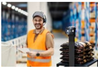
WAREHOUSE LOGISTICS CONCEPTS