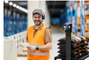
WAREHOUSE LOGISTICS CONCEPTS