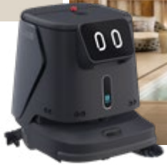
PUDU CC1 – Our autonomous cleaning robot.